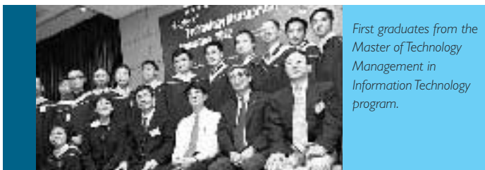
First graduates from the Master of Technology Management in Information Technology program.

Opportunities for professionals to build both knowledge and networks, locally and internationally, are being expanded through a series of innovative School of Engineering part-time Master's degree programs.