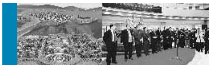
The model of the Nansha IT Park.